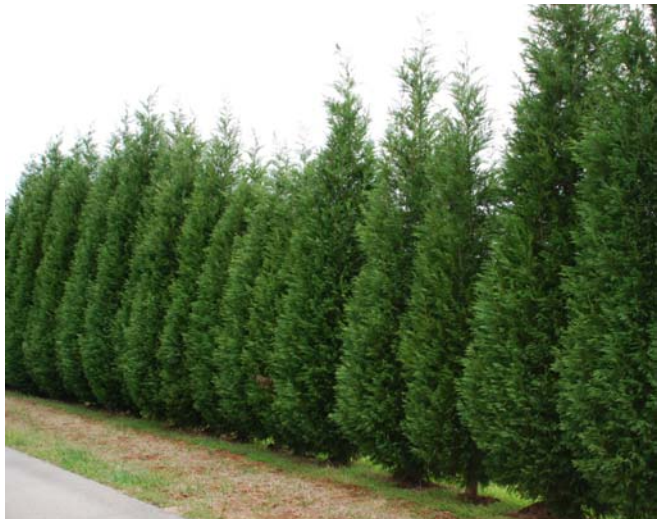
LEYLAND CYPRESS install: 8-10' mature: 50-60'