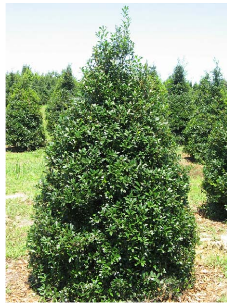
FOSTER HOLLY install: 18-10' mature: 20'