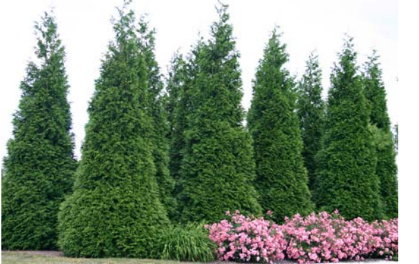
GREEN GIANT ARBORVITAE install: 8-10' mature: 40-50'