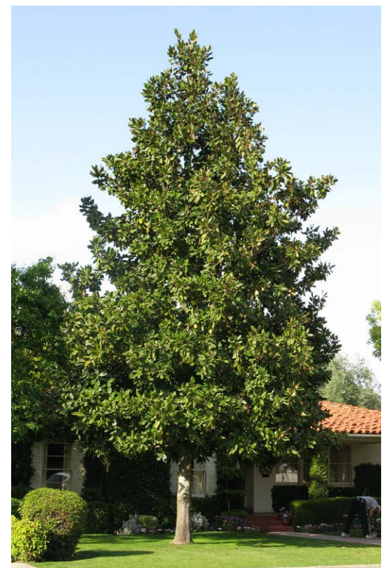
SOUTHERN MAGNOLIA install: 14-16' mature: 60-80'