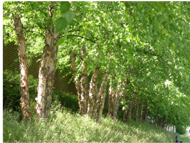
RIVER BIRCH install: 14-16' mature: 40-60'