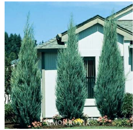
SKYROCKET JUNIPER install: 8-10' mature: 15-20'

*Arborist advice against preservation of the trees as they would become hazard.