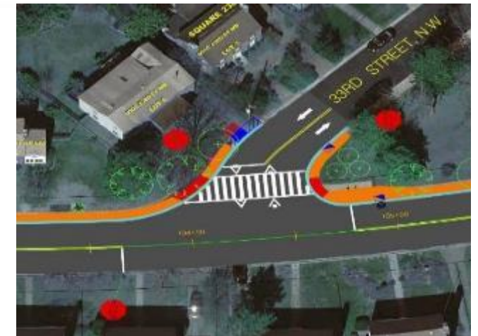
Chestnut Street with 32 nd Intersection Chestnut Street with 33 rd Intersection