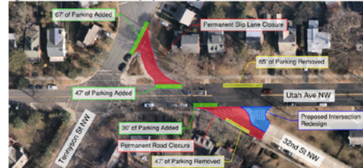
Figure 1 | Proposed Limits of Road Closure for 32 nd Street NW and Parking Removal for Utah Ave NW

All comments on this subject matter must be filed in writing by Tuesday, April 04, 2023 (thirty business days after the date of this notice), with the District Department of Transportation (DDOT), Transportation Operations Administration at 250 M Street, SE, Washington, D.C. 20003.