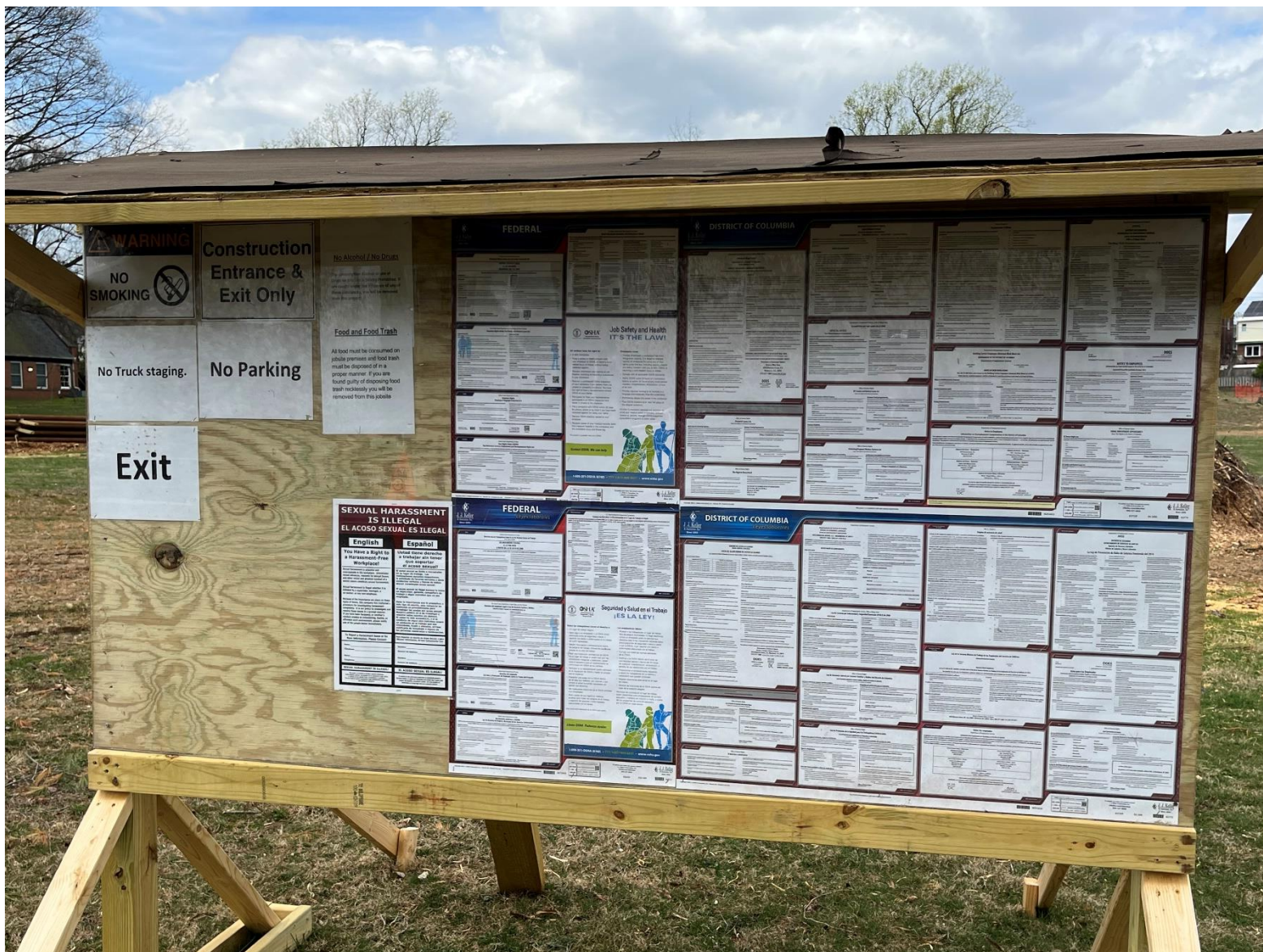
Figures 1 – 3: Permit and Signage Boards