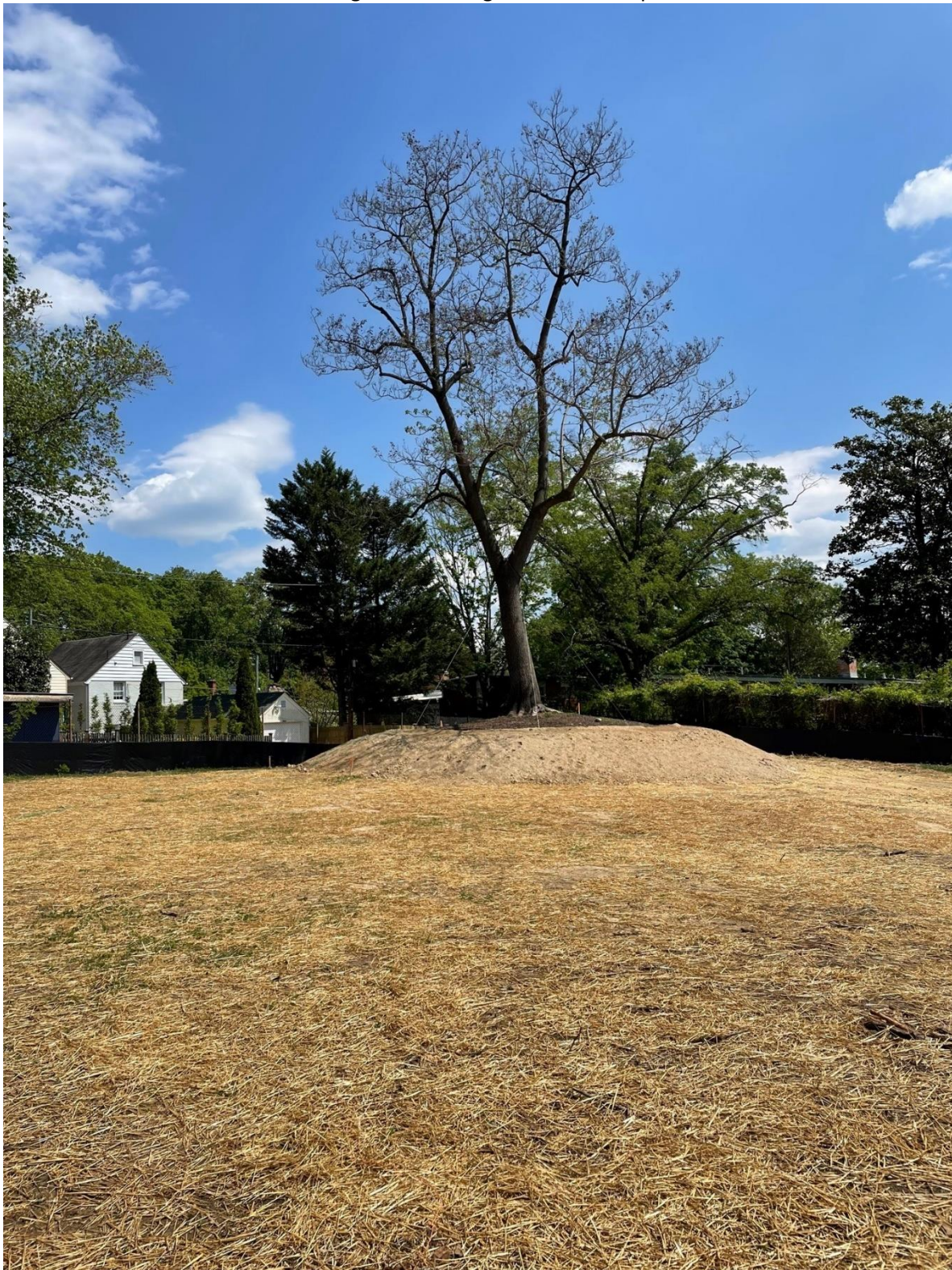
Figure 4: Heritage #1 move completed