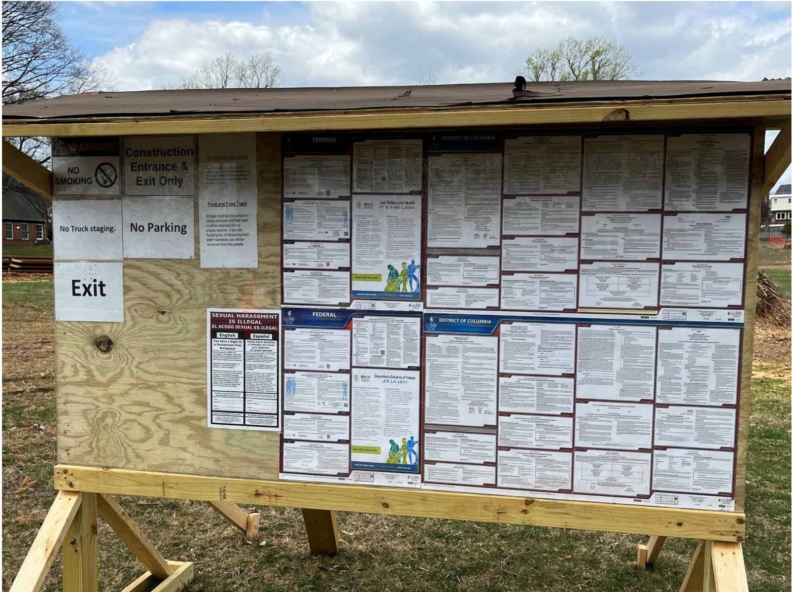
Figures 1 – 3: Permit and Signage Boards